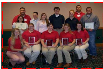
JCS attendees show their achievements after competing at the Conclave.

The University of Arizona competed among 27 universities in four national collegiate competitions. They were