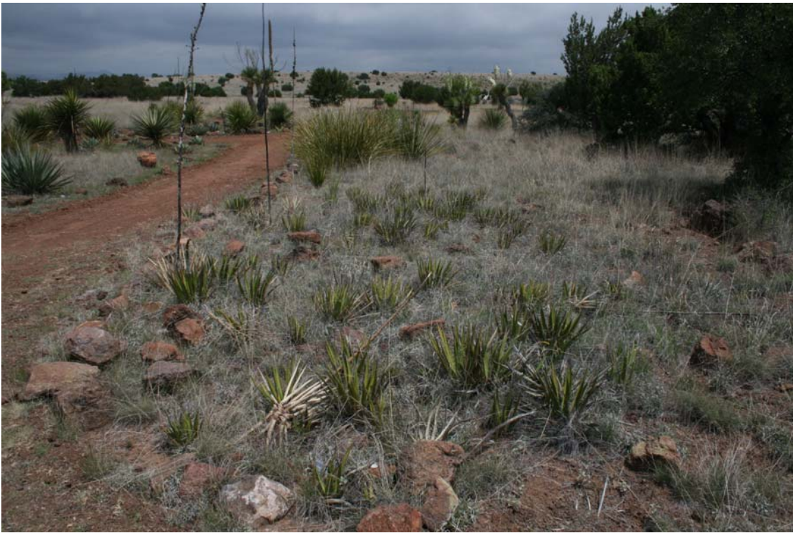
These Agave lechuguilla are in the Chihuahuan Desert.

Smaller agaves are perfect for either a container or the landscape. One of the smaller agaves, A. gracilipes , whose common name is the slim-footed agave, is native to the Guadalupe Mountains and sand dune areas of west Texas. It thrives at higher elevations and can commonly be found at about 5,000. 66 Agave lechuguilla , an indicator plant of the Chihuahuan Desert, is common in thick concentrations on hillsides and well-drained slopes in western Texas. One observer noted that it is usually sunburned in nature and not attractive. 67 Indeed, as pictured below, that is what we found when we observed these plants at the Chichuachuan Desert Nature Center and Botanical Gardens just outside of Ft. Davis, Texas. When planted in the garden, given extra water and a little fertilizer, Texas gardeners find that this plant becomes a vivid green and grows larger than when found in the wild. Because it lives about 10 to 15 years, it can be relied upon to survive in a container or garden for many years. 68