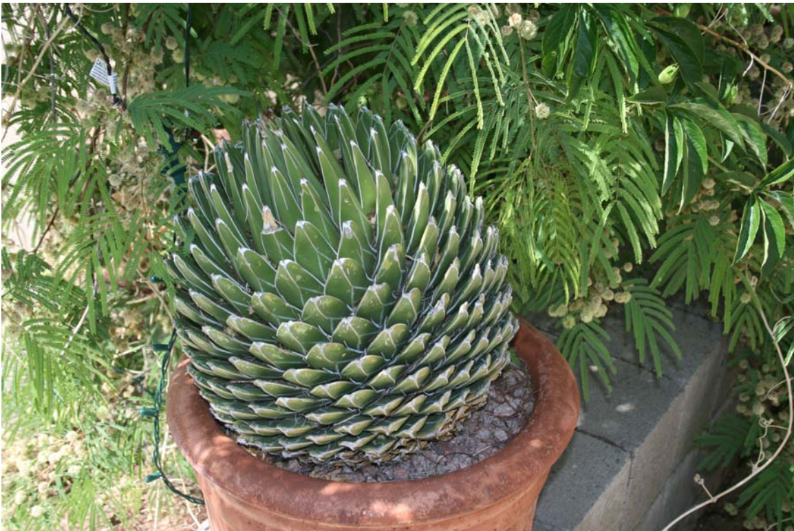
This A. victoria reginae is growing out of doors in a pot at the Arizona Sonoran Desert Museum.

Several species are especially attractive in pots. 47 Agave filifera have decorative narrow olive green leaves that bear loose curled threats at the margins. Agave pecta have narrow pale green leaves with white margins and small black teeth. Probably the quintessential agave for containers is A. victoria reginae . It is a striking plant with olive green leaves beautifully penciled with white edges. It grows to only about a foot across and will maintain its compact, geometric form for many years before flowering and dying. 48