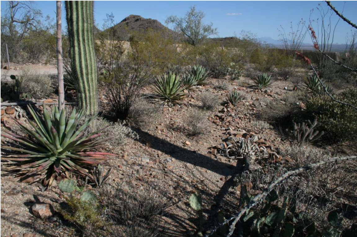
The Arizona Sonoran Desert Museum has replicated an ancient agave garden.

cultivated in stepped areas of slopes. The terraced fields helped capture rainwater while ensuring excellent drainage for the plants.