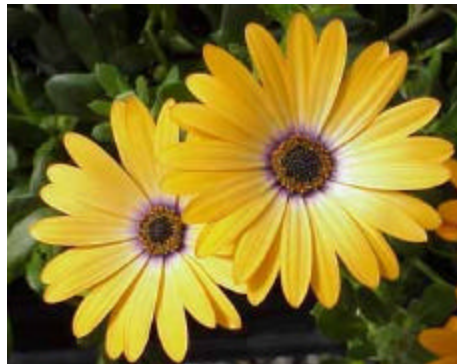
We had a lot of African daisies

got to visit and explain the design, construction, and planting of our yard. There is a lot of interest in water conservation in Sierra Vista, but the biggest surprise was the interest in our vegetable garden. A small space can produce a lot for a small family.