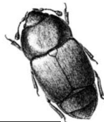
Dusky Sap Beetle