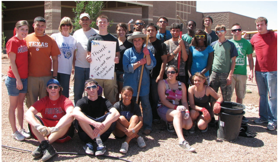
Thanks from the students to CCMGA!