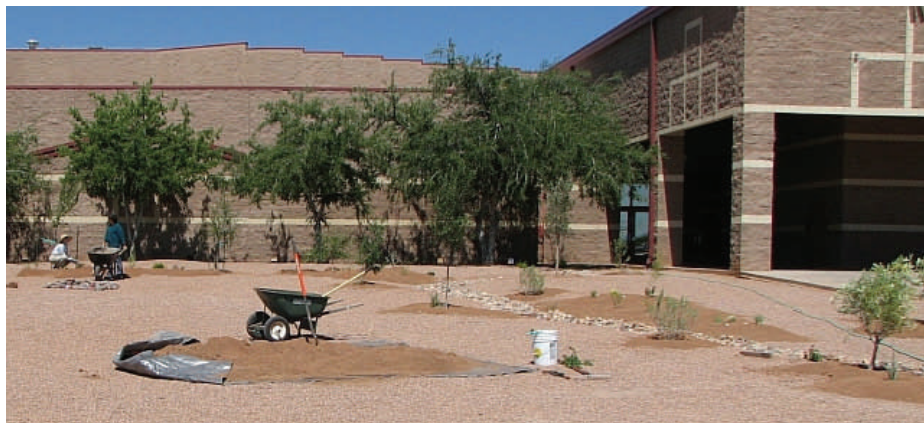
The project is nearly completed.