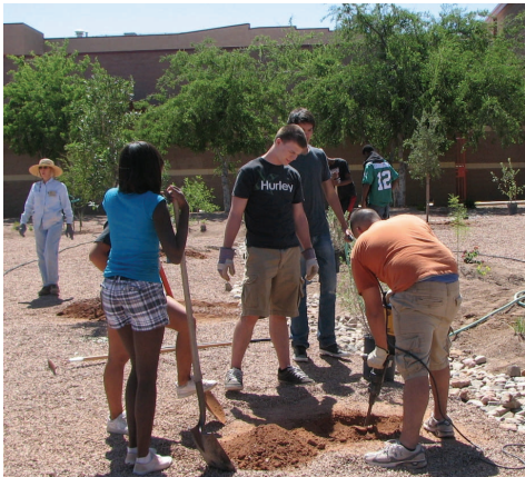
The soil was REALLY REALLY hard!