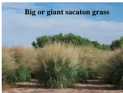
Big or giant sacaton grass

Buffelgrass ( Pennisetum ciliare ) is a fire hazard and a rapidly spreading grass. Fortunately it does not survive the colder winters in the Chihuahua Desert of Southeastern Arizona. The grass that is growing in your wash is most likely alkali sacaton grass ( Sporobolus airoides ) or big/giant sacaton grass ( Sporobolus wrightii ). It is native to Southern Arizona and grows in areas where there is adequate moisture like meadows or washes. Alkali sacaton is 1 to 3 ½ feet tall with long, narrow, rolled, drooping leaves. Big/giant sacaton is nor-