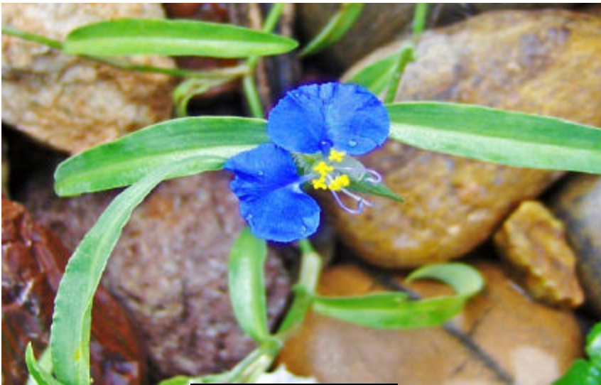
Bird's bill dayflower