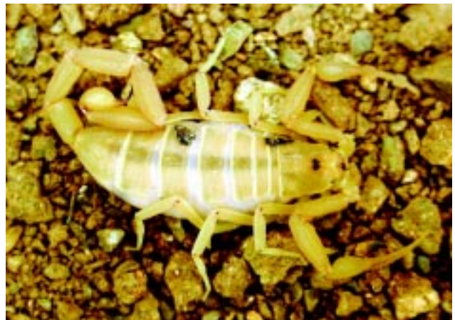
Bark scorpion viewed under normal daylight.

Never look directly at an ultraviolet light, damage to the eye can occur.