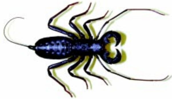
Whipscorpion or vinegaroon

Solpugids are pale-tan arachnids. The body can be up to an inch and a half in length, with a pair of heavy pinchers dominating the front end. They have four pairs of long legs and pedipalps in front that are used in touching and smelling. They run fast and climb well. Solpugids subdue their prey with their pinchers, which lack poison glands.