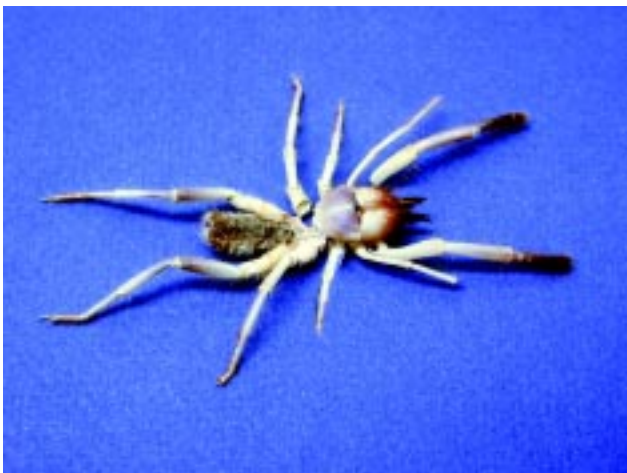
Solpugid, sun spider or windscorpion

Pseudoscorpions are arachnids with a body length of approximately 1/8th inch. The pedipalps give them a strong resemblance to true scorpions. Natural habitats for pseudoscorpions include under leaf litter and mulch, in moss, under stones and beneath tree bark. They have also been reported in bird nests and between siding boards of buildings. Pseudoscorpions are predaceous and can inflict a venomous bite.