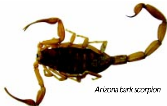
Arizona bark scorpion

About 40-60 species occur in Arizona, although many are undescribed. The bark scorpion ( Centruroides exilicauda ) is the only species in Arizona of medical importance.