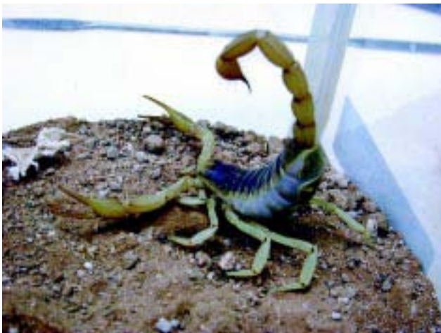
Desert hairy scorpion

Another species found in Arizona is the desert hairy scorpion ( Hadrurus arizonensis ). This species is twice as large as the bark scorpion at maturity (up to 5 inches long). They are often found in low sandy areas throughout the state.