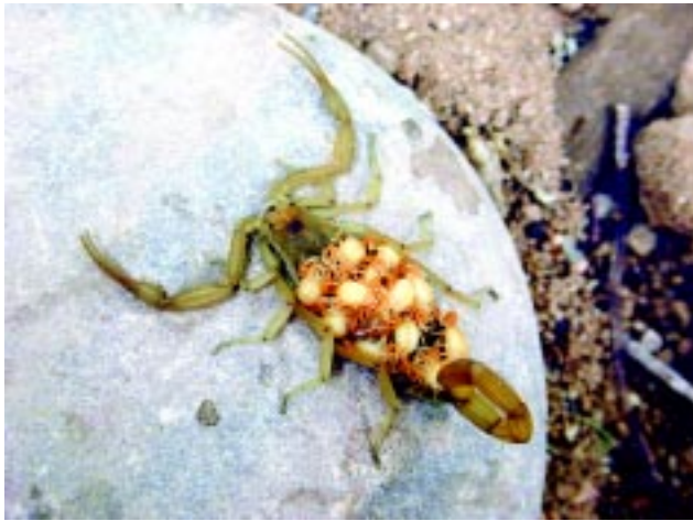
Female bark scorpion with young on her back

Scorpions have a long gestation period (from several months to over a year, depending on species) in which the young develop as embryos in the female ovariuterus or in specialized diverticula that branch from the ovariuterus. The young are born live and ascend their mother's back. She assists them by making a "birth basket" with her folded legs to catch them as they are born and to provide them with a means to climb to her back. A few Old World species do not form birth baskets.