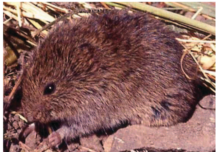
Fig. 1. —A subadult Microtus californicus from Richmond Field Station, Contra Costa County, California, 3 June 1994.

M. c. grinnelli Huey, 1931:47. Type locality “Sangre de Cristo in Balle San Rafael on the western base of the