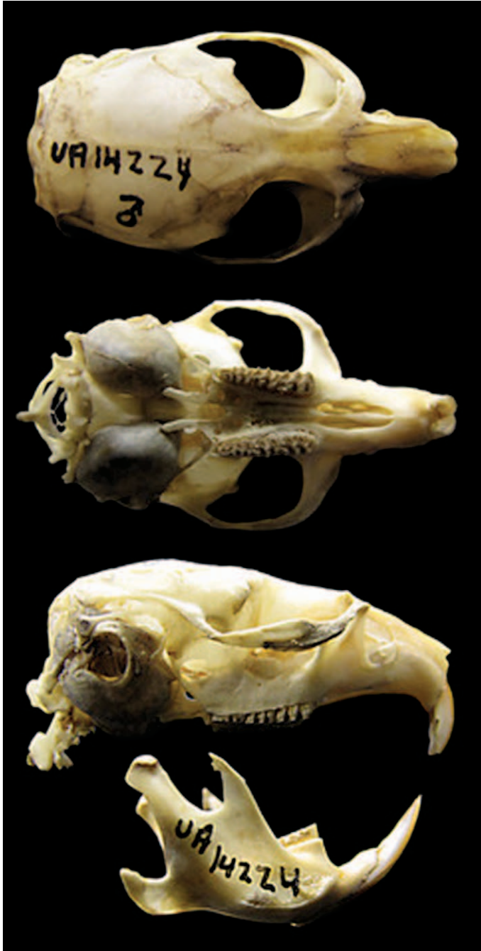
Fig. 2. —Dorsal, ventral, and lateral views of skull and lateral view of mandible of an adult male Microtus californicus (UA [The University of Arizona mammal collection] 14224) from end Rock Oak Road, Walnut Creek, Contra Costa County, California. Occipitonasal length is 26 mm.