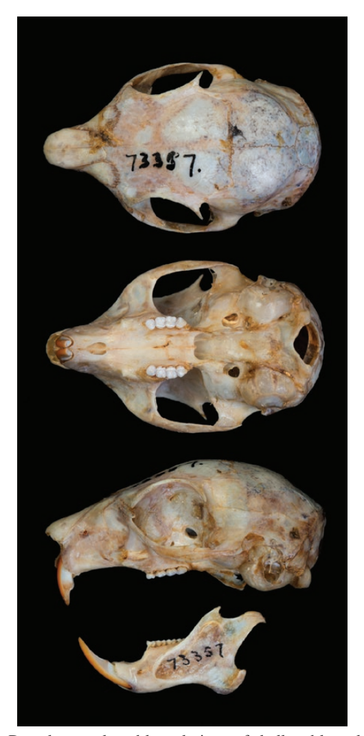
Fig. 2. —Dorsal, ventral, and lateral views of skull and lateral view of mandible of an adult (sex unknown) Microsciurus flaviventer (American Museum of Natural History [AMNH] #73357) from Puerto Indiana, Maynas, Loreto, Peru. Greatest length of skull is 38.5 mm.

Length of head and body in M. flaviventer ranges between 120 and 160 mm; length of tail is 80–155 mm; hind foot length is 39–43 mm; and ear length is 16–17 mm (Eisenberg 1989; Eisenberg and Redford 1999). M. flaviventer body mass ranges from 86.2 to 132 g (Eisenberg and Redford 1999; Hayssen