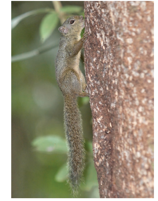
Fig. 1.—Adult Microsciurus flaviventer from Tiputini, Ecuador. Sex unknown. Photo by George Lamson used with permission.

© 2016 by American Society of Mammalogists.