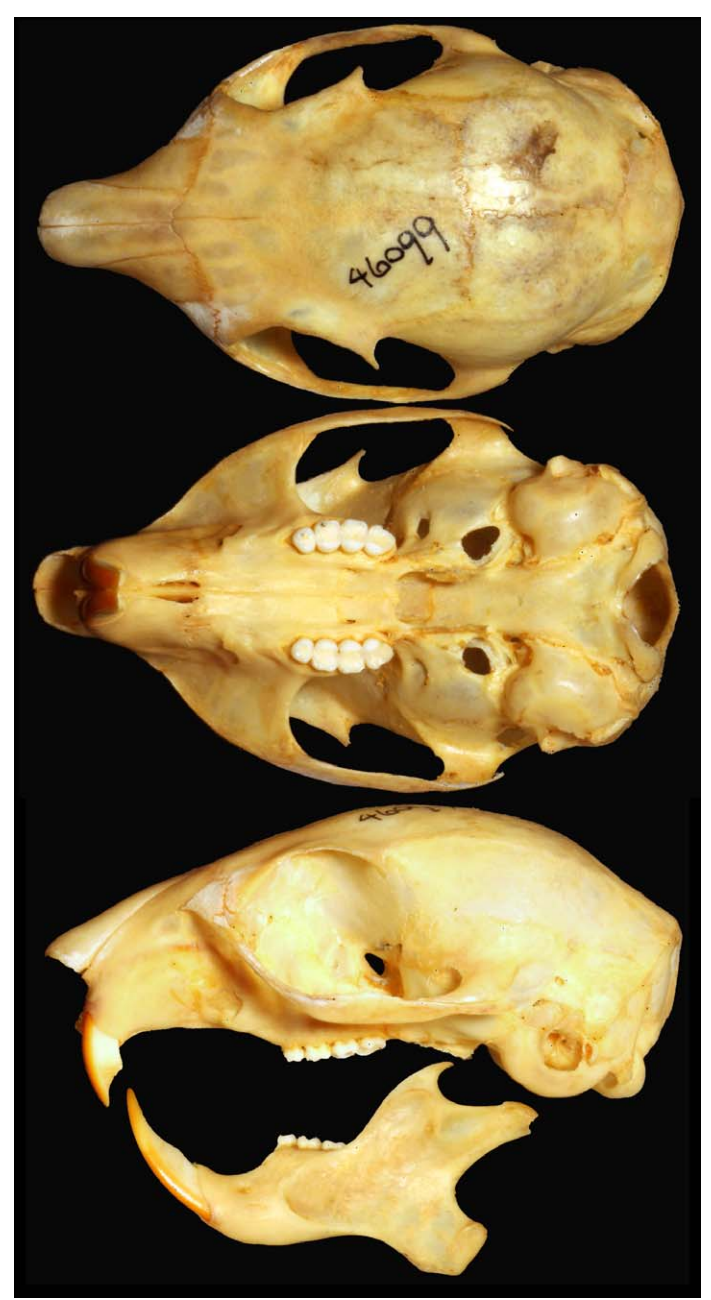
Fig. 3. —Dorsal, ventral, and lateral views of skull and lateral view of mandible of Sciurus ignitus (Field Museum of Natural History [FMNH] 46099, female collected on 20 June 1927 by F. B. Steinbach), from Chapare, Cochabamba, Bolivia, 2,000 m above sea level. Greatest length of skull is 50 mm.