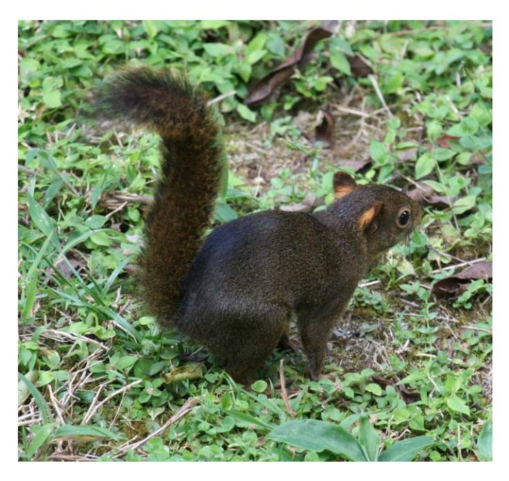
Fig. 1. —Adult Sciurus ignitus (sex unknown) taken at the Cock-ofthe-Rock Lodge, Manu Road, Peru, July 2008.