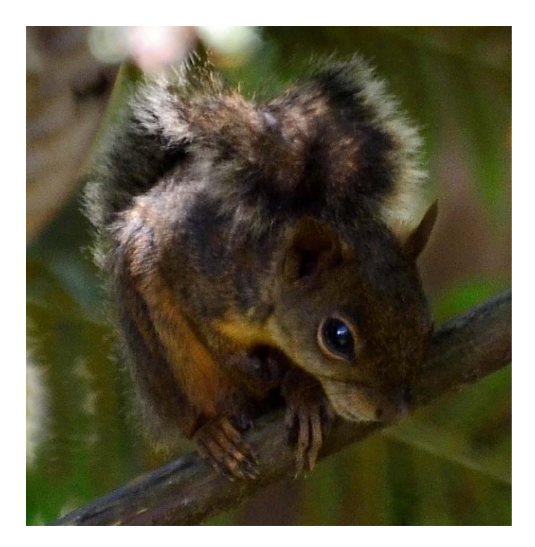
Fig. 2. —Subadult Sciurus ignitus taken at Hotel Esmeralda, Coroico, Bolivia (16°11′21″S, 67°43′11″W, altitude: 1,660 m above sea level), October 2012.

Haugaasen and Peres 2005; Hayssen 2008). Total length of adult S. ignitus varies from 315.0 to 450.0 mm (Anderson 1997). Head and body length of adult S. ignitus ranges from 140.0 to 220.0 mm (Anderson 1997; Emmons and Feer 1999) and the mean is less in adult females compared to males (female = 184.8 mm; male = 191.0 mm—Hayssen 2008). Tail length in S. ignitus ranges from 150.0–230.0 mm (Anderson 1997; Eisenberg and Redford 1999; Emmons and Feer 1999) with mean tail lengths of adult males and females similar (female = 191.9 mm; male = 190.8 mm—Hayssen 2008). Hind-foot length in S. ignitus ranges from 41.0 to 52.0 mm and ear length varies from 20.0 to 30.0 mm (Anderson 1997; Eisenberg and Redford 1999; Emmons and Feer 1999).