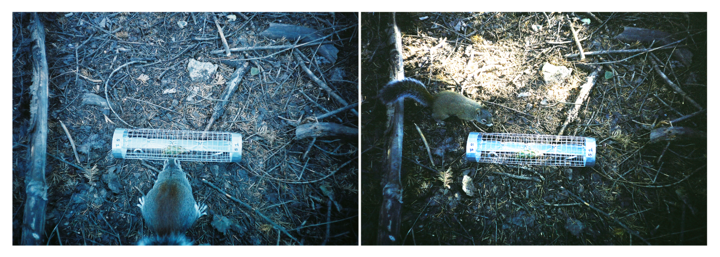
Fig 1. Activity at an Abert's squirrel (Sciurus aberti) exclusion cone tube, Pinaleño Mountains, Autumn 2008. Abert's squirrels (Sciurus aberti, left) were excluded from access to cones in this treatment, whereas Mount Graham red squirrels (Tamiasciurus hudsonicus grahamensis, right) were able to remove cones.

We measured forest-stand structure and vegetation characteristics in 10 m radius plots [40] centered about the initial placement point of the 30 cone tubes in order to investigate the influence of forest structure on cone removal rates. We recorded average canopy cover determined